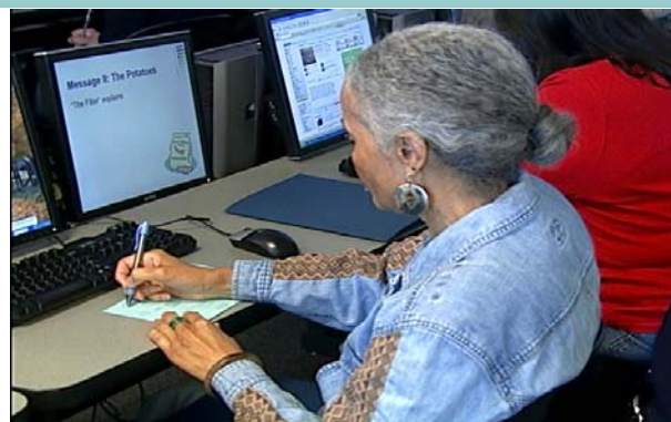
PUSD employees learned about improving customer service, creating welcoming school environments and preparing for disasters at the Classified Professional Development day January 30 at PHS.

The City of Glendale is hosting Super CPR Day on March 7th . Cost is $10 for Adult CPR certification. Morning or afternoon classes are available. Class size is limited to 200 people per session. Register at www.arcglendale.org .